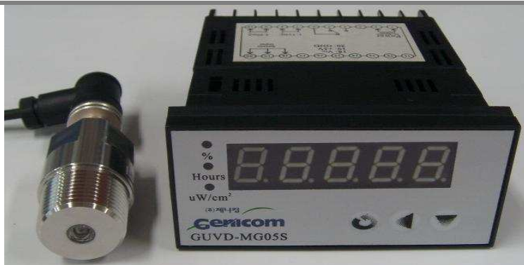
Fig. 1 UV Radiometer 5.0 (Size of Display : 97 × 50 × 112mm)