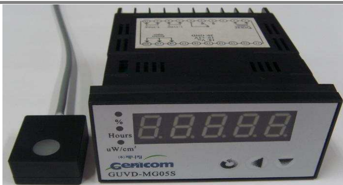
Fig. 1 UV Radiometer 5.0 (Size of Display : 97 × 50 × 112mm)