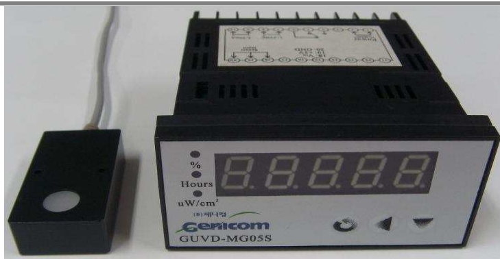
Fig. 1 UV Radiometer 5.0 (Size of Display : 97 × 50 × 112mm)